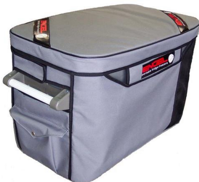
Transit Bag - TBAGECL40